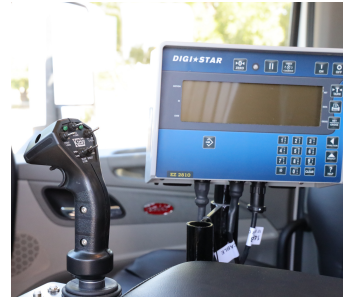
FULL IN CAB CONTROLS