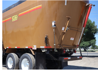
HYDRAULIC REAR DOOR