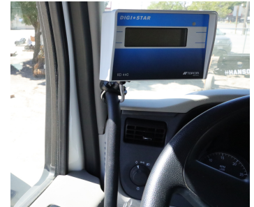
OPTIONAL SIDE SCALE

Since 1946, Kirby has been obsessed with great products and great service. Our Vertical Mixers exemplify this commitment from end to end, creating a product that keeps the TMR the same on the first cow as it is on the last.